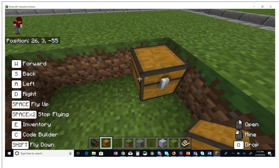
Square 4 – Mining Pit Two Diamonds-Emeralds