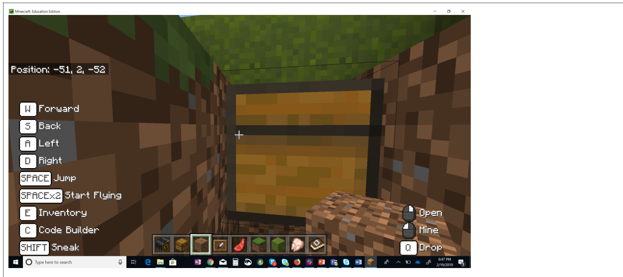
Square 2 – Cave Painting