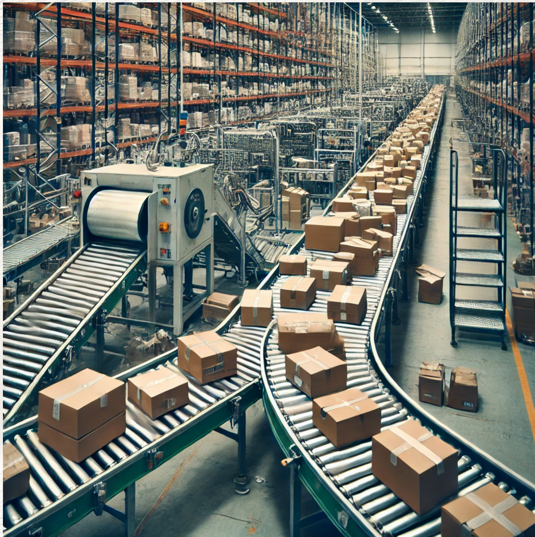
BOTTLENECK ON THE PRODUCTION LINE