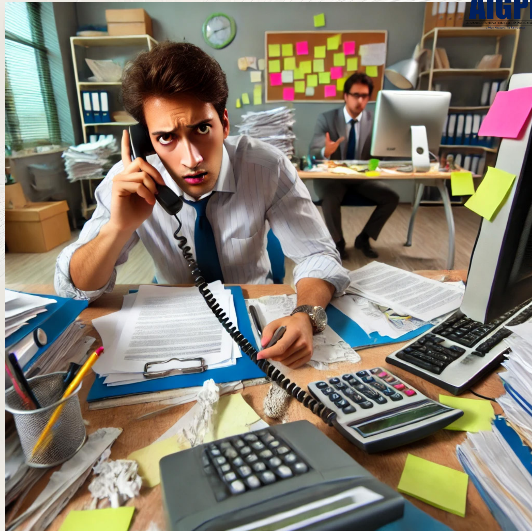
CUSTOMER COMPLAINT PILING UP