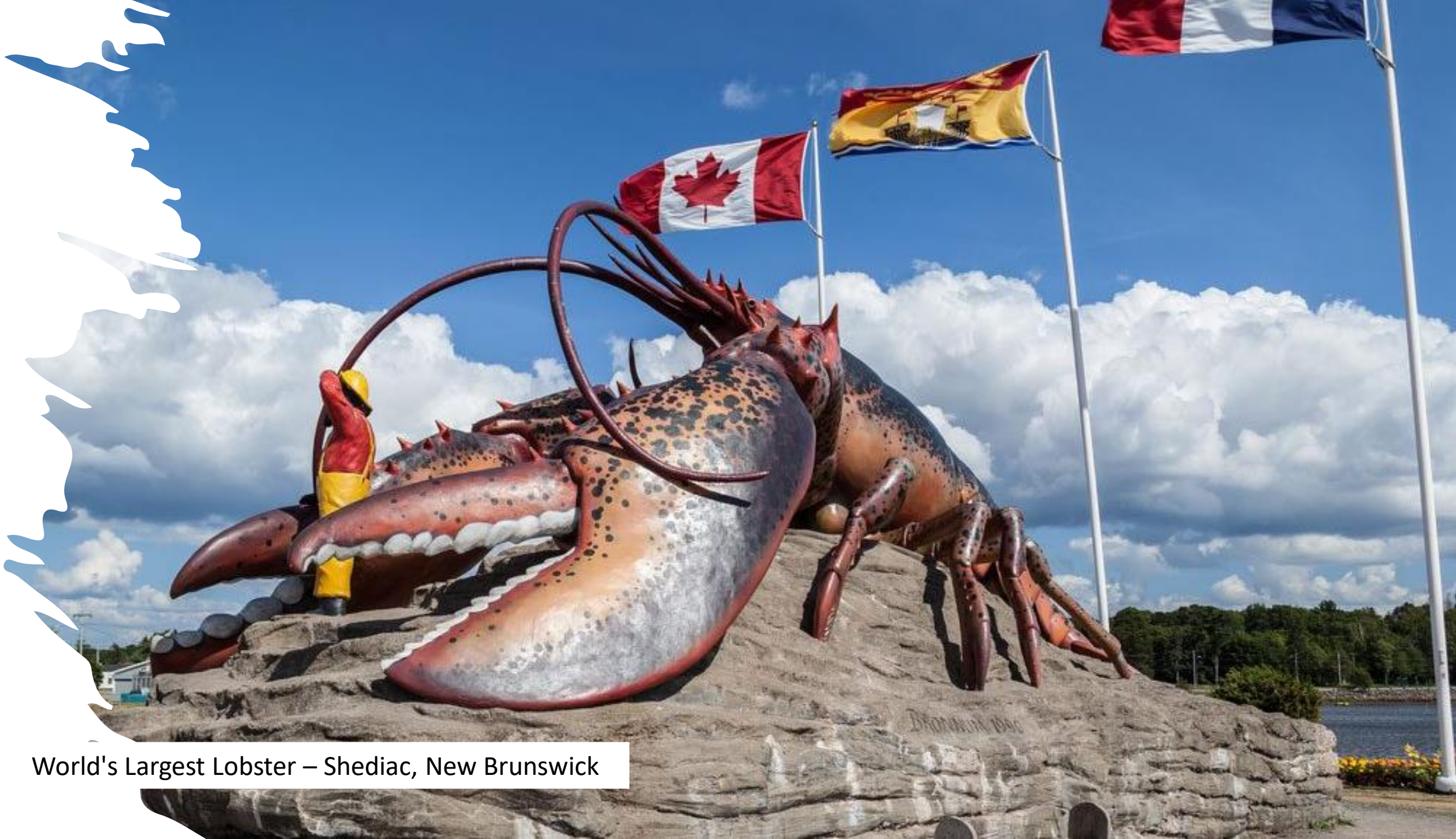
World's Largest Lobster – Shediac, New Brunswick