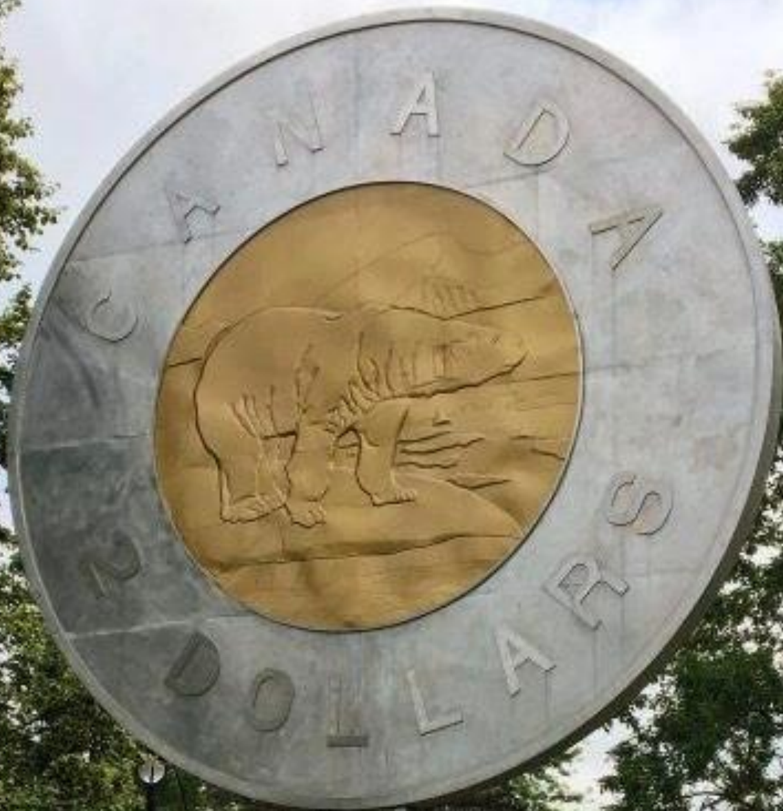
Toonie – Campbellford, Ontario