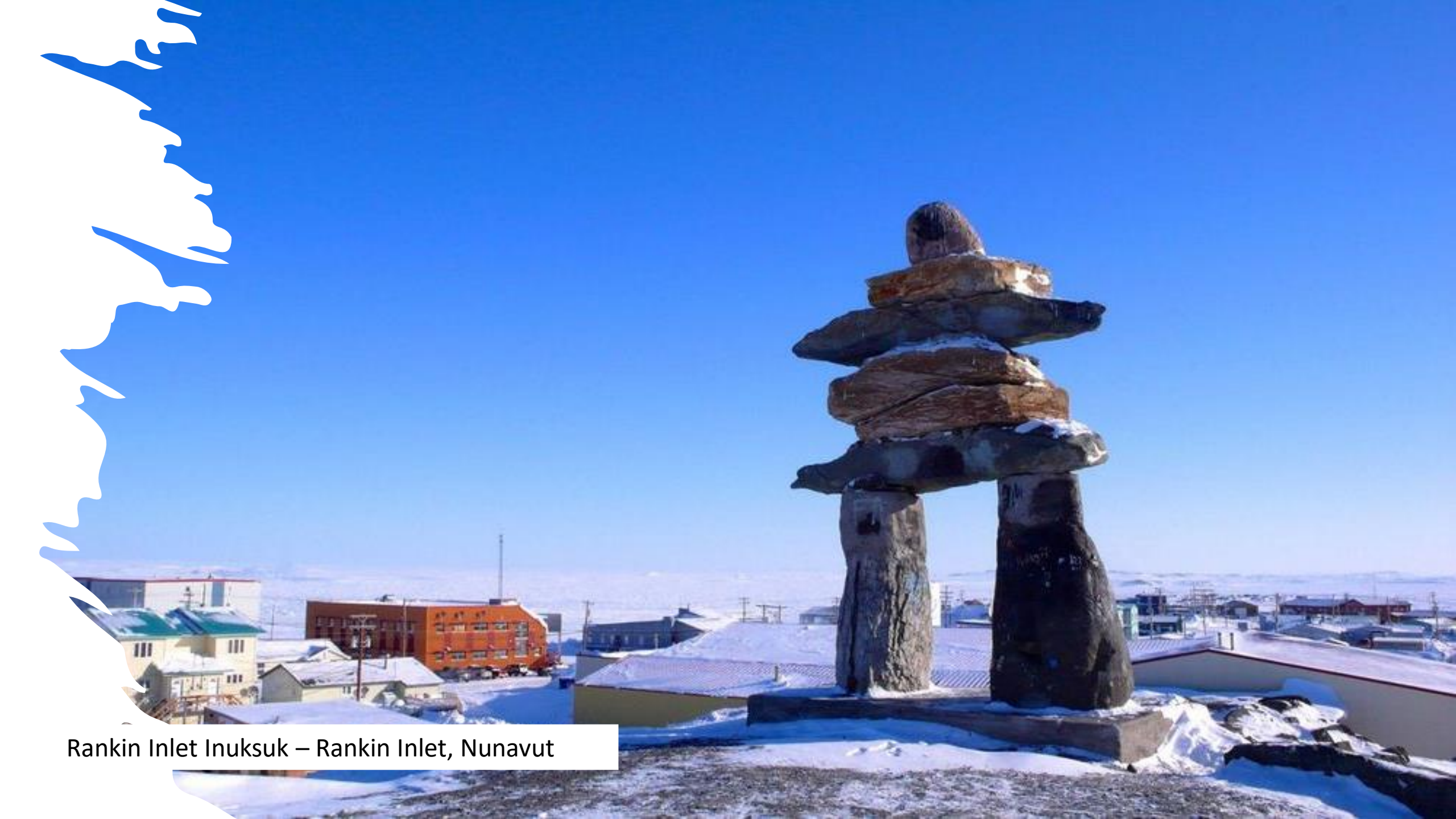
Rankin Inlet Inuksuk – Rankin Inlet, Nunavut