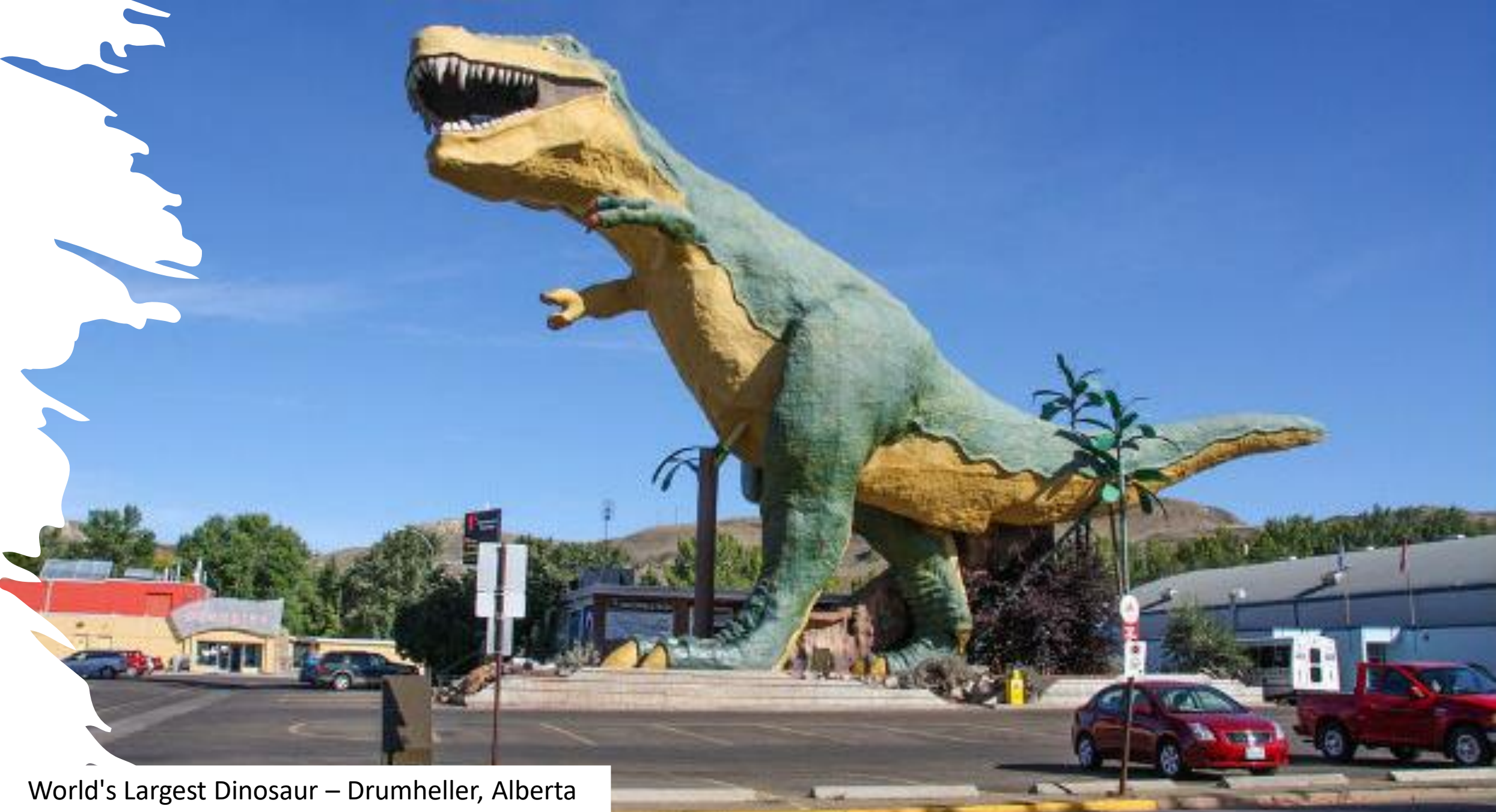
World's Largest Dinosaur – Drumheller, Alberta