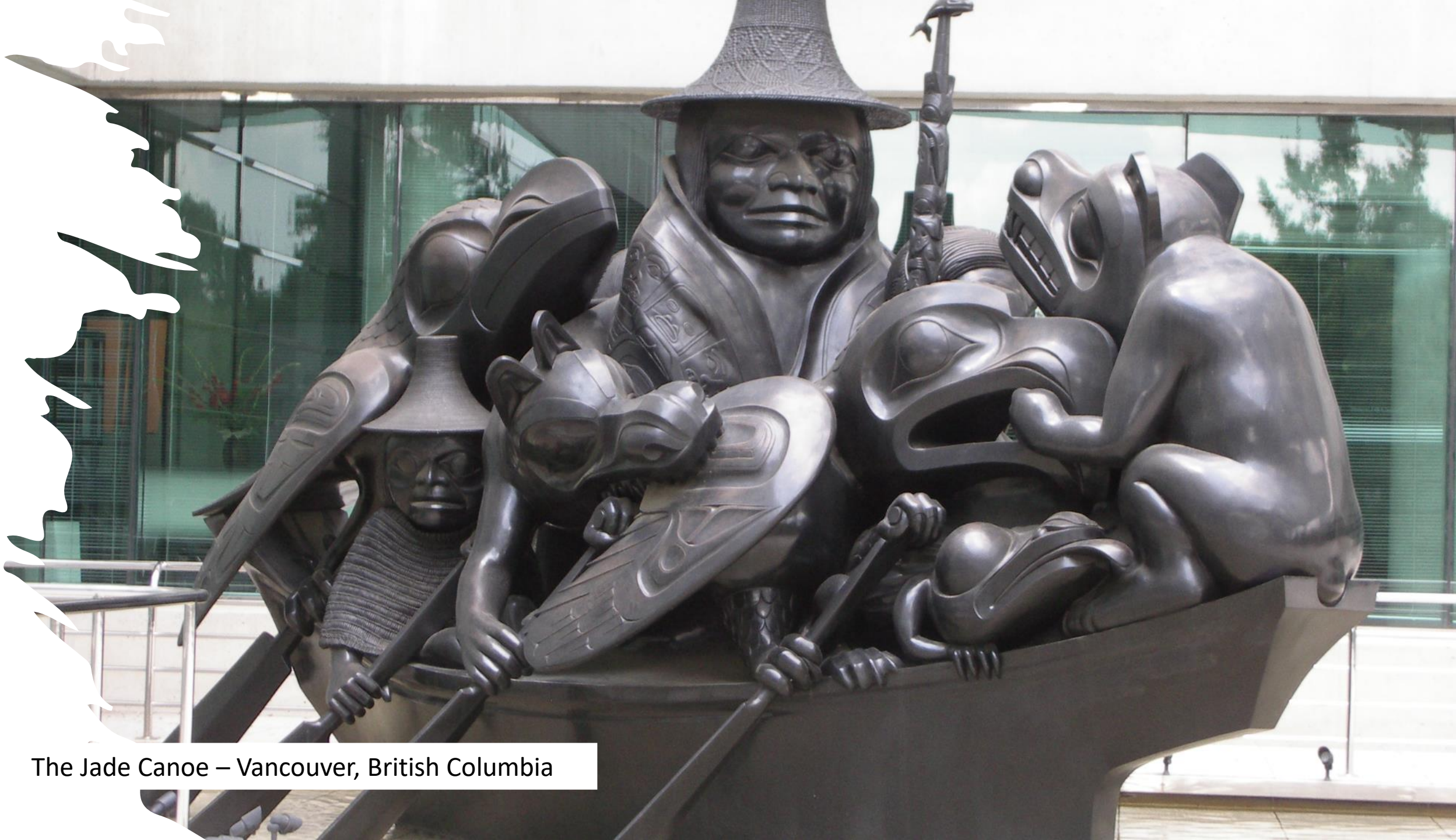
The Jade Canoe – Vancouver, British Columbia