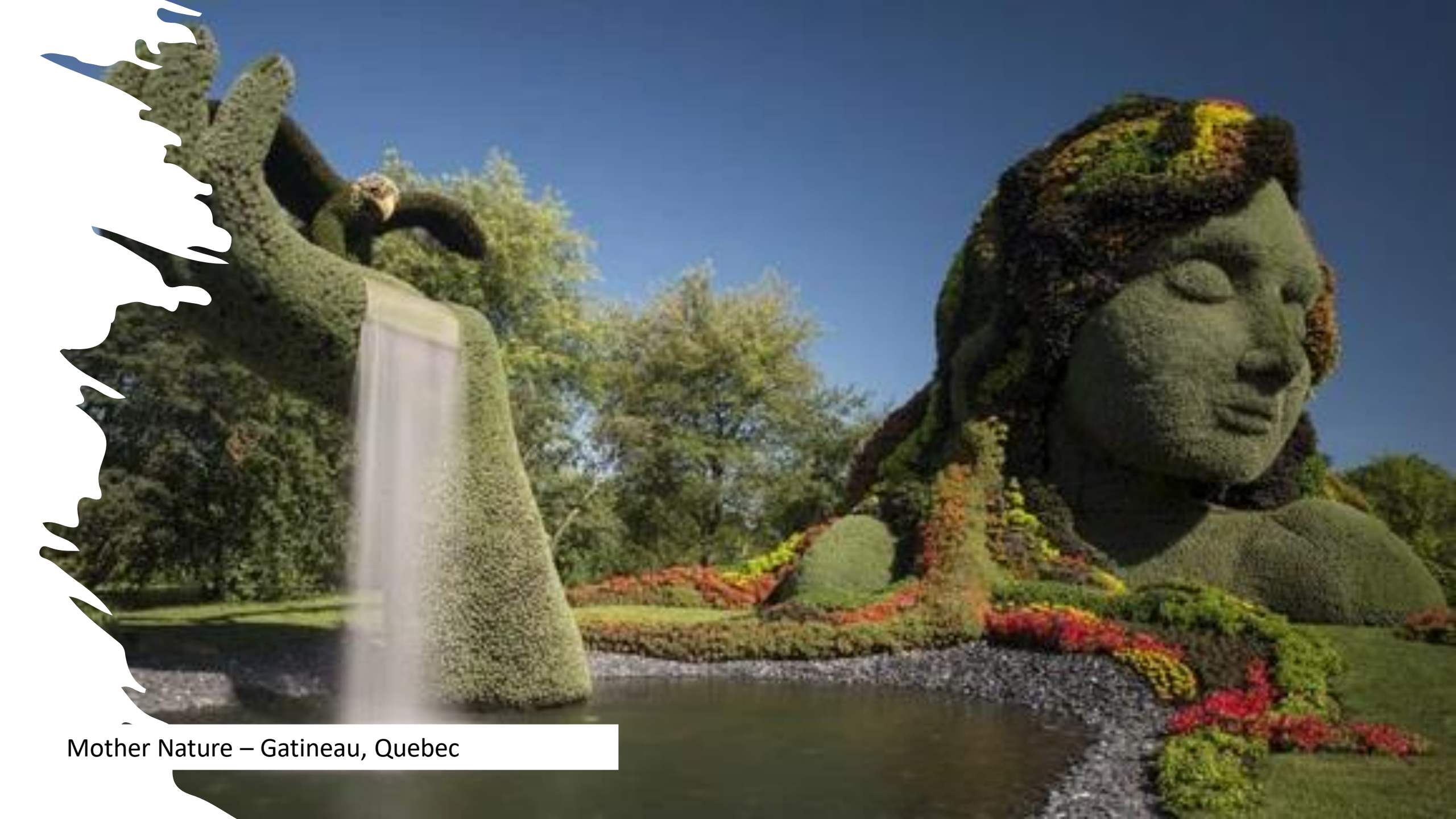
Mother Nature – Gatineau, Quebec