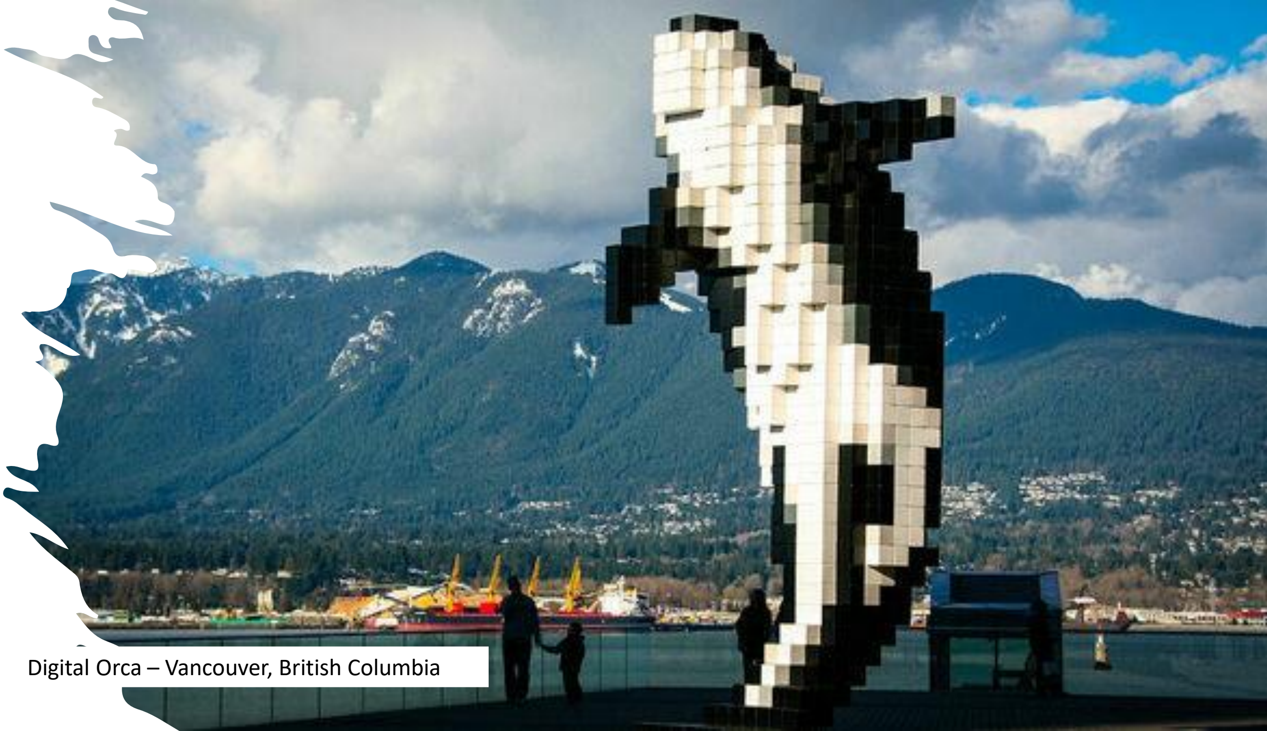
Digital Orca – Vancouver, British Columbia